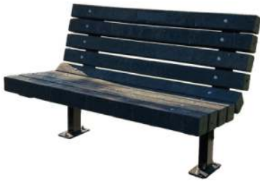
Park Bench PB-700