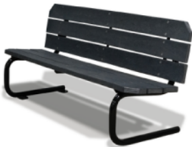
Tube Bench with Back PB-600

Frame - powder coated steel. Standard frame color – black. Customizable upon request. 100% recycled plastic lumber boards – grey. Includes plates to bolt to concrete. Bench lengths can be customized with the inclusion of additional supports.