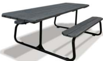
Accessible Picnic Table PTF-701

Frame - powder coated steel. Standard frame color – black. Customizable upon request. 100% recycled plastic lumber boards – grey. Includes plates to bolt to concrete.