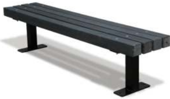
Park Bench without Back PB-750

Frame - powder coated steel. Standard frame color – black. Customizable upon request. 100% recycled plastic lumber boards – grey. Includes plates to bolt to concrete. Bench lengths can be customized with the inclusion of additional supports.