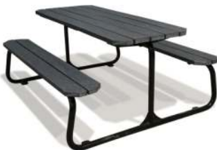
Picnic Table PTF-700

Frame - powder coated steel. Standard frame color – black. Customizable upon request. 100% recycled plastic lumber boards – grey. Includes plates to bolt to concrete.