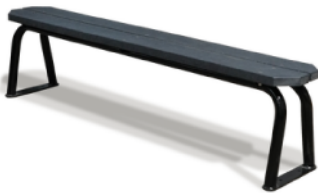
Tube Bench without Back PB-650

Frame - powder coated steel. Standard frame color – black. Customizable upon request. 100% recycled plastic lumber boards – grey. Includes plates to bolt to concrete.